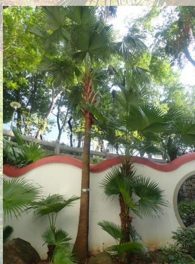
噴泉形態 fountain-like form