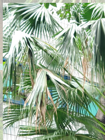
像帳篷的葉 tent-like fronds